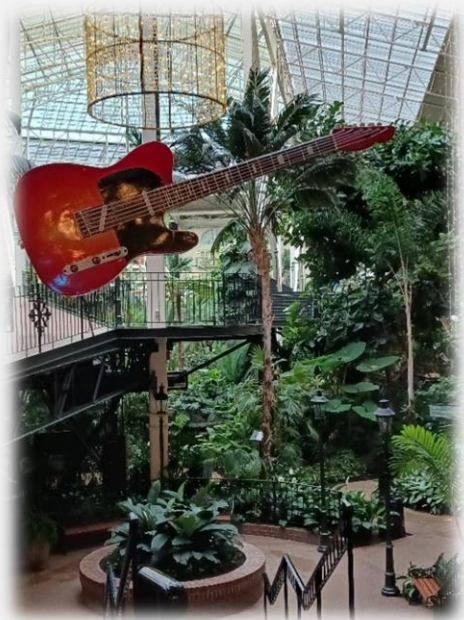
Hanging Out at the International Convention in Nashville, Tennessee

The next training period begins in November. Our District goal for club officer training is 85%. To achieve that goal, we will offer three training opportunities within the District: Early Bird, in person, and online. In addition, we will publish links for all open online training available in neighboring districts.